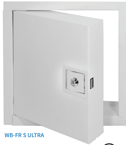
WB-FR S ULTRA