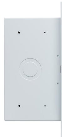
14148R – SIDE VIEW RECESSED