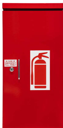
Model HDOEC - STYLE 1