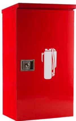
Model HDOEC - STYLE 2