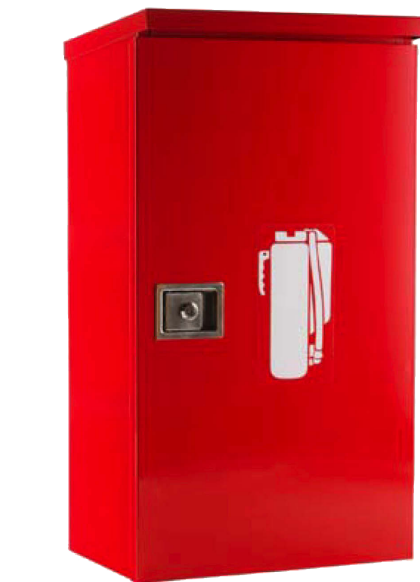
HDOEC - STYLE 2