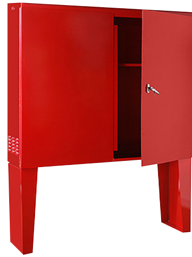
CM-1101 - TYPE D (24" LEGS SHOWN)